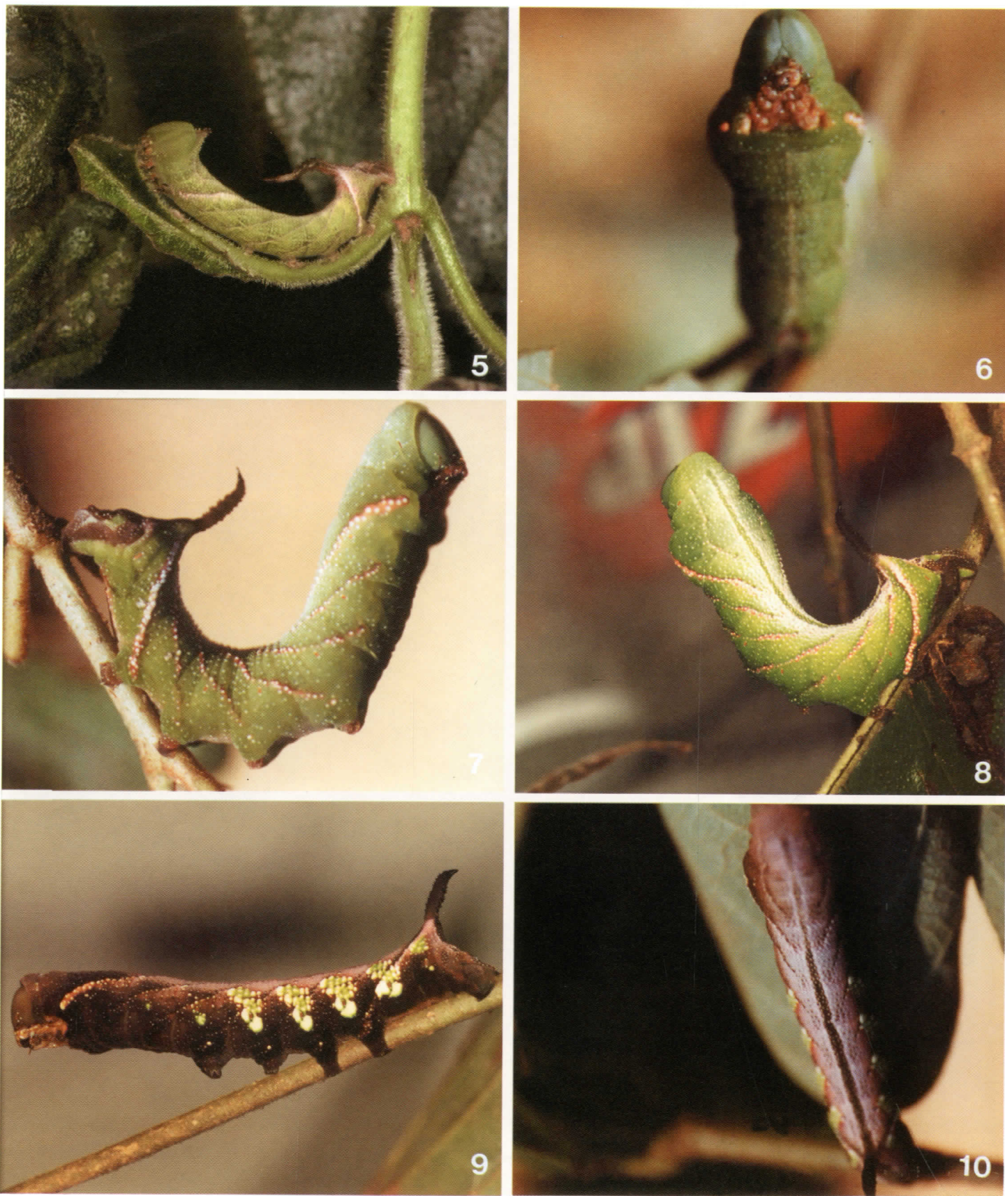
Fig. 5-10. Eupyrhroglossum sagra : 5) 3rd instar E. sagra larva on Guettarda scabra , with typical leaf damage pattern. 6) 5th instar E. sagra larva in defensive pose. 7) Green form 5th instar E. sagra larva. 8) Another view of a green form 5th instar E. sagra larva. 9) Brown form 5th instar E. sagra larva. 10) Dorsal view of brown form 5th instar E. sagra larva.